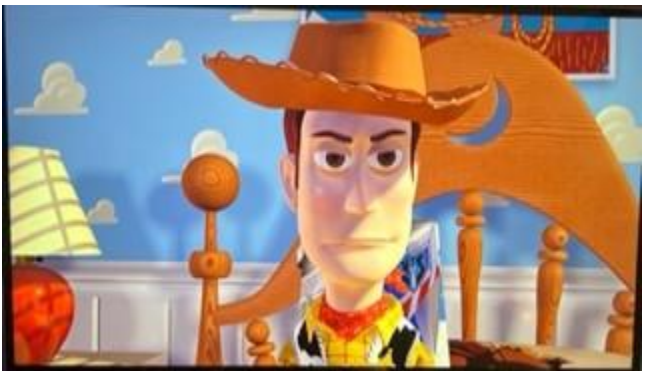
Space Ranger do?

Stop 20:12 after I'm still Andy's favorite toy